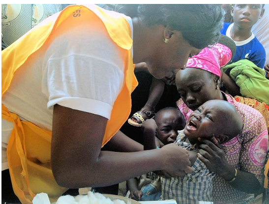
A healthcare worker vaccinates a child in Tamale, Ghana

We provide disaster relief and Lions are often some of the first to arrive to provide relief, help devastated communities survive after disasters and bring hope by assisting in long-term efforts of rebuilding of homes and lives.