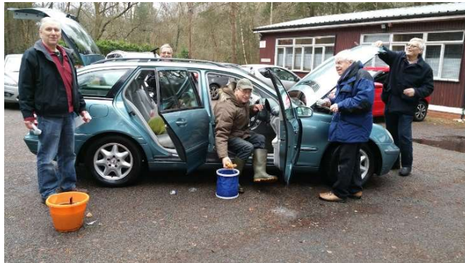
A surprise 60 th birthday present; a team of Fleet Lions valet a car as part of the 100 wishes programme

Throughout the year we receive requests from groups, local organisations and individuals to help them either to achieve a worthwhile project, or assist them in times of hardship or disability.